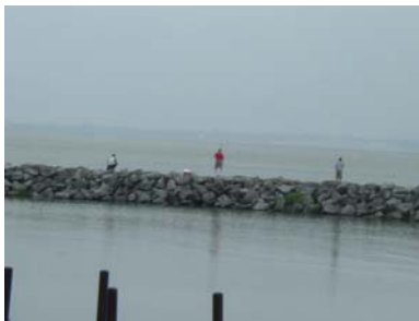
Fishing on Sandusky Bay.

As the new year begins, now is a great time for resolutions. Of course, you have probably broken many of them by now, but who's counting. Here is a resolution you can keep. Renew your commitment to clean water in your community. If you haven't renewed your membership yet, now is your chance. It's easy to do, and you'll feel good knowing that you are supporting the health of the water our community depends on. Want to make a bigger impact? Get a friend to join! Give a gift membership or just talk to your friends and neighbors about joining on their own. Getting those around you to join will help raise their awareness of water quality concerns and will benefit your neighborhood! Visit our website for the membership form. Don't have internet access, just give us a call and we'll send a form to you.