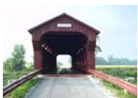
Swartz Bridge—one of 3 covered bridges in the watershed.