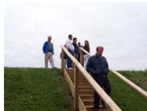
SC members at the New Washington Reservoirs.