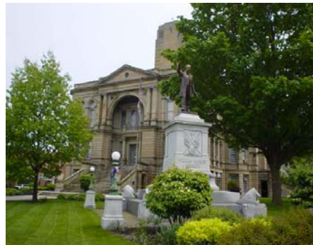
Seneca Co. Courthouse—one of several hundred sites of interest in the watershed.