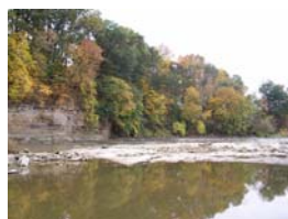
Sandusky River in Ballville Twp., Sandusky County.

The Development Committee has begun discussions with WBGU and other interested groups in an attempt to produce a video on the Sandusky River Watershed. Although the project is still in its earliest stages, there is a lot of excitement within the group about the potential for a video.