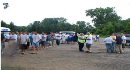
Left—Volunteers await the picnic lunch. Center— Clean up site crew with bags of trash collected. Right—One volunteer proud to show off his unusual find.