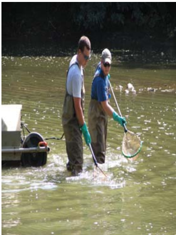
Fish Shocking Demonstration earlier this summer.